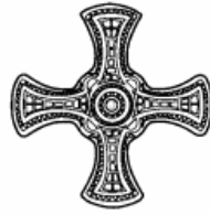
St. Cuthbert's Cross